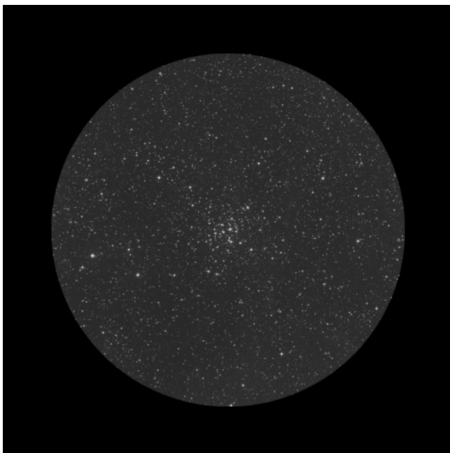
Nagler 31mm (70x - 1° 10' - 6.6mm)

Data of the sky region at the time of the observation ..... SQM-L 21.5 IR -38 Temperatura ambiente 2° Data of the night ..... Alt sol: -68° Alt luna: -58.8° Data of the object ..... Alt: 54.5° Az: 82.7° Telescope ..... Stargate 18"