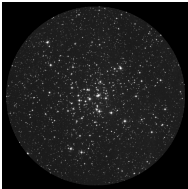
Ethos 10mm (216x - 27' - 2.1mm)

Data of the sky region at the time of the observation ..... SQM-L 21.5 IR -38 Temperatura ambiente 2° Data of the night ..... Alt sol: -68° Alt luna: -58.8° Data of the object ..... Alt: 54.5° Az: 82.7° Telescope ..... Stargate 18"