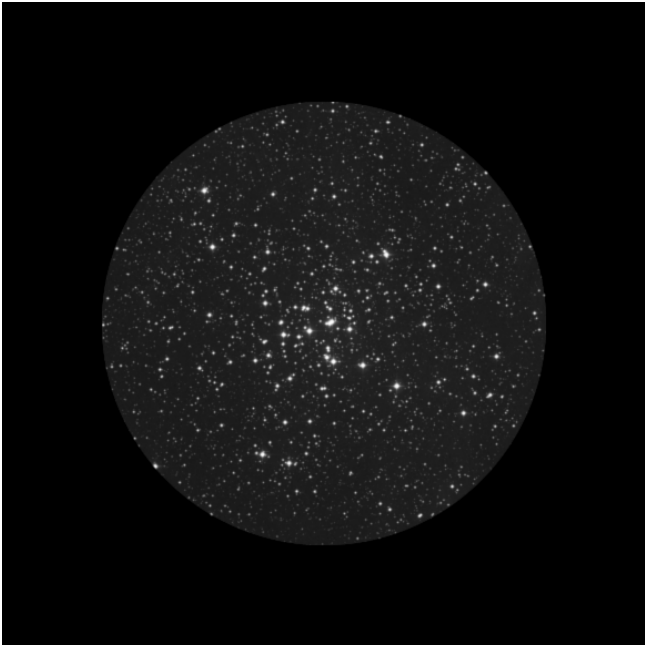
Delos 14mm (154x - 28' - 3mm)

This eyepiece always reduces my field a lot when going from 82° of apparent field to the 72° of the Delos but I don't dislike it. The object has considerably increased in size but what strikes me is how new fainter stars keep appearing (and they are now easily discovered).