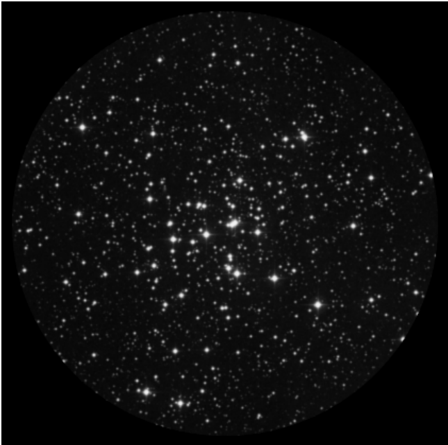
Ethos 8mm (270x - 22' - 1.7mm)

The last eyepiece change for this object and I reaffirm that M36 is an object that improves with higher magnification. The amount of faint stars that are perceived inside the open cluster (not as a diffuse cloud, but as individual stars) makes you look at it with totally different eyes. Because now you play on the contrast between magnitudes of stars. The main ones that shape