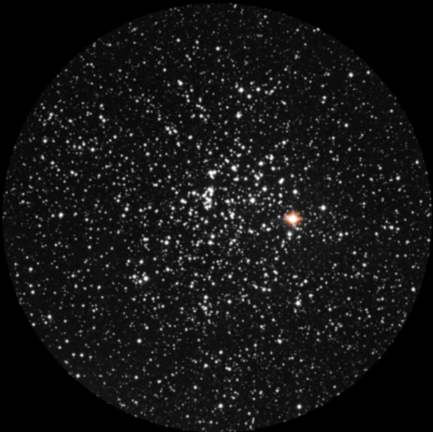
Ethos 8mm (270x - 22' - 1.7mm)

more detail than I have already explained. I didn't go beyond this magnification because I didn't see anything that caught my attention to be observed in detail.