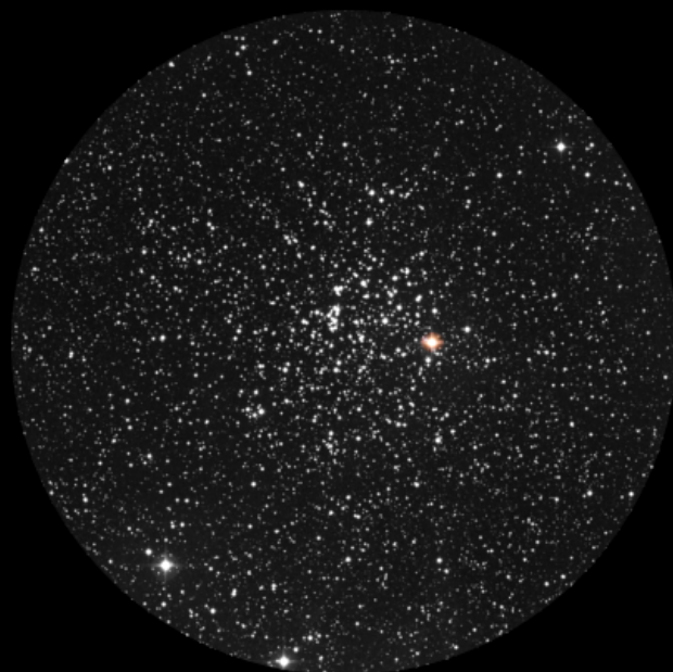
Ethos 10mm (216x - 27' - 2.1mm)

part of the open cluster, although it is impossible to get rid of the shape of the moth that I have drawn in my mind.